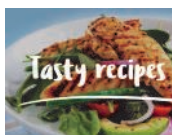
Temporarily try something new? Looking for healthy recipes? Look no further! Our recipes are low in saturated fat and heart healthy.

Red is associated with saving lives and combating danger.