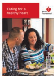
Eating for a healthy heart

Think of red roses, hearts on Valentine's Day cards and songs through the ages. In relation to anger, the expression 'seeing red' is possibly based on physical expressions of anger such as redness of the face. How you respond to red though depends on previous experiences.